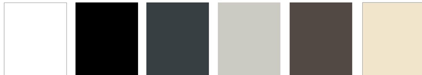
White (9910 high gloss) Black (9011 semi gloss) Grey (7016 matt) Silver Grey (7035 semi gloss) Brown (BS08-B29 semi gloss) Cream (1013 semi gloss)

Bi-fold doors can be coloured on one or both sides, and feature a matt or gloss finish depending on your chosen colour (other RAL colours available upon request):